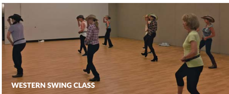
WESTERN SWING CLASS