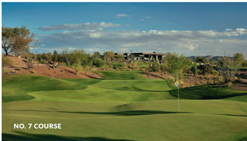
NO. 7 COURSE

Set against a beautiful high desert backdrop, the 8,900-square-foot clubhouse at Seven Desert Mountain™ features a casually elegant gastropub with indoor and outdoor dining and bar areas, five fire pits and two fireplaces, heated patio floors, as well as two bocce ball courts. It is the quintessential family friendly gathering place.