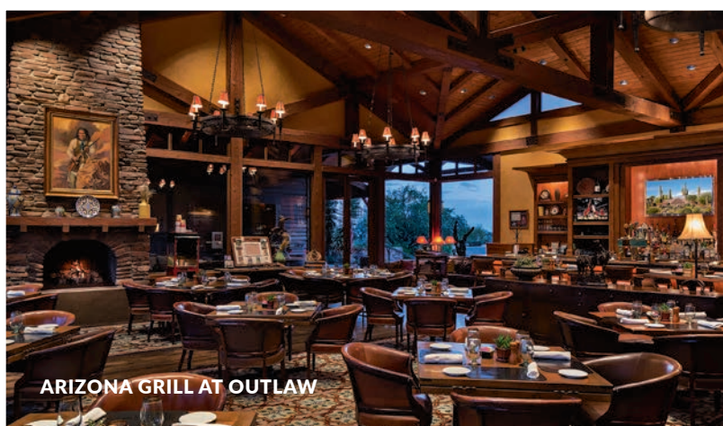
ARIZONA GRILL AT OUTLAW