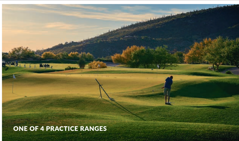
ONE OF 4 PRACTICE RANGES